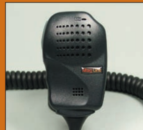
Mag One Remote Speaker Microphone PMMN4008

The following Mag One accessories have been tested with the BPR 40 to ensure maximum performance.