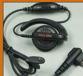
Mag One Ear Receiver with In-line Microphone and PTT/VOX Switch PMLN4443_B