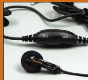
Mag One Earbud with In-line Microphone and PTT/VOX Switch PMLN4442