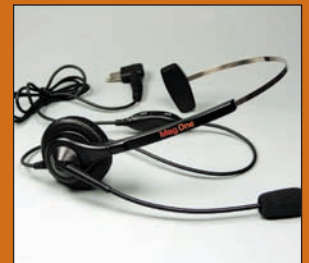
Mag One Ultra Lightweight Headset with In-line PTT/VOX Switch PMLN4445