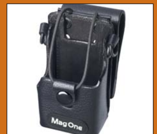
Mag One Hard Leather Case PMLN4742