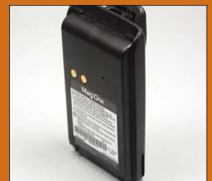
Mag One 1200mAh NiMH Battery PMNN4071_R